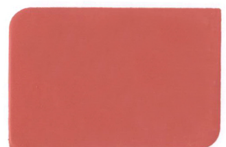
Tile Red 50015

All colours shown are as close to the actual Nippon Paint colours as modern printing techniques permit.