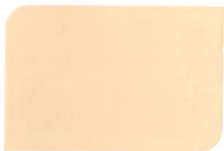
Evening Tea 50017