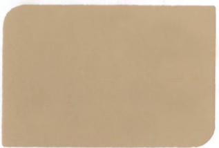
Natural Brown 50012