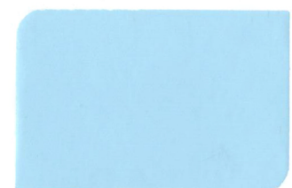
Sea Blue 50020